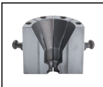
Custom Made Dies (pg. 41)