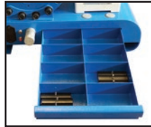
Die Storage Drawer