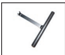
Die Change Tool